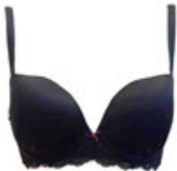
ECB878/51 T-shirt Bra

AUSTRALIA : 8-16 / B-D UK : 30-38 / B-D US : 30-38 / B-D EUROPE : 65-85 / B-D FRANCE : 80-100 / B-D