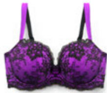
ECB878/111 U/W Bra

AUSTRALIA : 8-16 / B, C, D, DD, E UK : 30-38 / B, C, D, DD, E US : 30-38 / B,C,D,DD,DDD,G EUROPE : 65-85 / B-G FRANCE : 80-100 / B-G