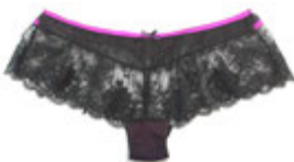
ECB878/114 French Knicker

AUSTRALIA : 8-16 / B, C, D, DD, E, F, FF, G UK : 30-38 / B, C, D, DD, E, F, FF, G US : 30-38 / B, C, D, DD, DDD, G, H, I EUROPE : 65-85 / B-H, J FRANCE : 80-100 / B-H, J