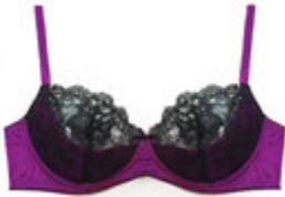
ECB878/121 U/W Bra with padded

AUSTRALIA : 8-16 / B, C, D, DD, E UK : 30-38 / B, C, D, DD, E US : 30-38 / B,C,D,DD,DDD,G EUROPE : 65-85 / B-G FRANCE : 80-100 / B-G