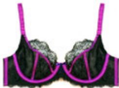
ECB878/131 3-section cup U/W Bra

AUSTRALIA : 8-16 / B-D UK : 30-38 / B-D US : 30-38 / B-D EUROPE : 65-85 / B-D FRANCE : 80-100 / B-D