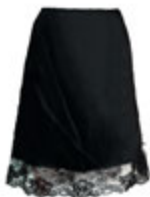
ECB878/04 Half Skirt

AUSTRALIA : 8-16 UK : XS-XL US : XS-XL (4-8) EUROPE : XS-XL (36-44) FRANCE : XS-XL (38-46)