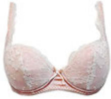
ECB878/91 Balconette Bra

Signature Balconnet bra with lace on cups whilst stretch silk on cups and bottom band. Excellent support bra cup design goes up to F cups. Rigid leavers lace covers cups and cradle. Wider shoulder straps and Hook & eyes are used for glamour sizes from DD cups.