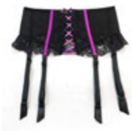
ECB878/116 Anchor Belt

AUSTRALIA : 8-16 UK : XS-XL US : XS-XL (4-8) EUROPE : XS-XL (36-44) FRANCE : XS-XL (38-46)