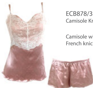
ECB878/38 +14 Camisole Knicker set

AUSTRALIA : 8-16 UK : XS-XL US : XS-XL (4-8) EUROPE : XS-XL (36-44) FRANCE : XS-XL (38-46)