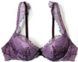
ECB944/11 Balconette Bra

Provides ultra push up effect. Removable padding provides flexibility for the wearer. Perfect fit for petite A cup size ladies.